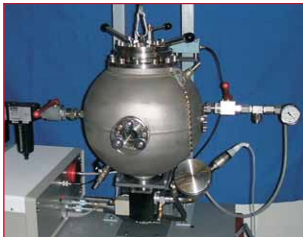
20 Ltr Sphere Apparatus